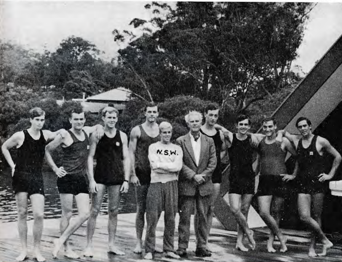
NEW SOUTH WALES