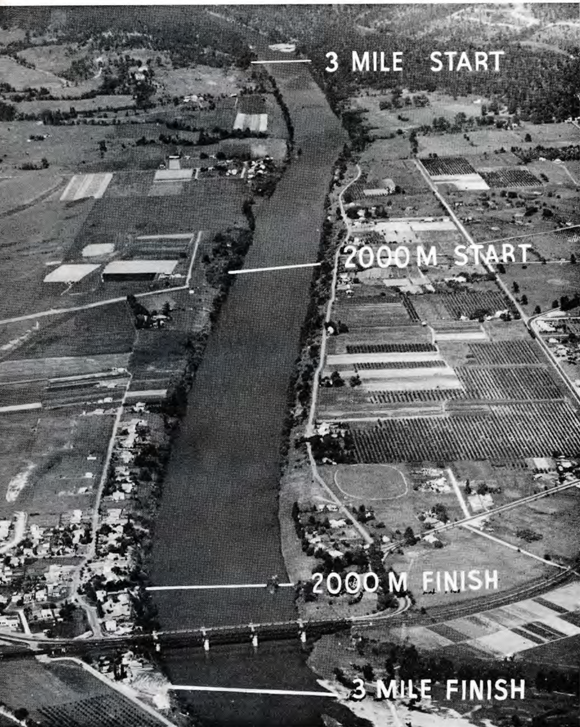
Aerial View showing start and finish of both the 3 mile and 2,000 metre courses.