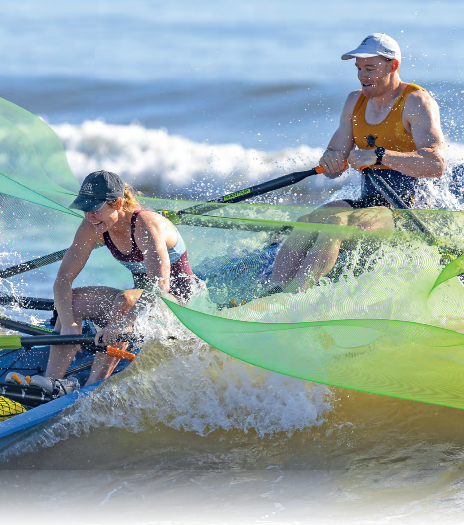
ROWING AUSTRALIA ANNUAL REPORT 2022