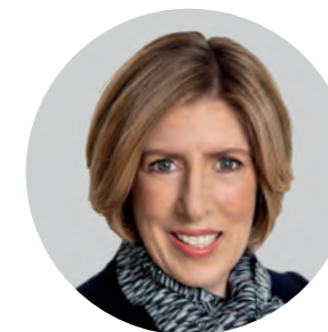
BRIGADIER ALISON CREAUGH AM CSC (RETD)