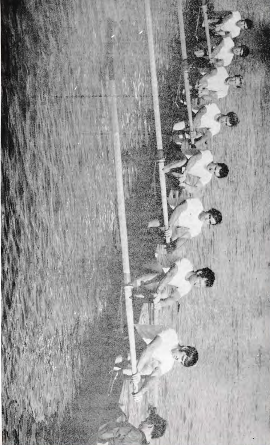
NEW ZEALAND EIGHT