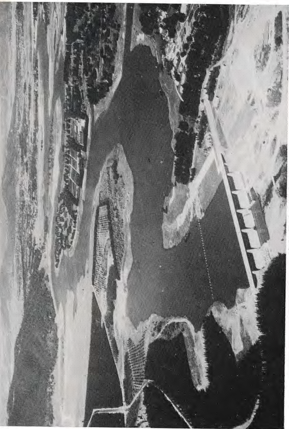
Lake Burley Griffin.